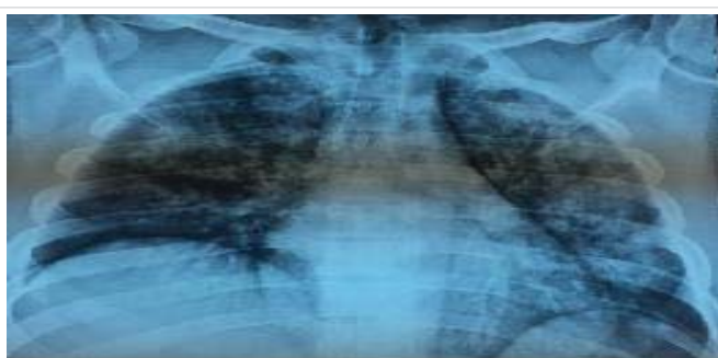
Figure 1: Chest X-ray showed bilateral pulmonary infiltrates with normal cardiac silhouette.

Clinical Presentation of DAH is typically acute, and patients usually show severe respiratory symptoms such as dyspnea, hypoxemia, hemoptysis and cough. Hemoptysis is a common, however it's not an invariable manifestation of the disorder [1]. Chest X-ray may show bilateral lung infiltrates, while chest computed tomography generally shows diffuse bilateral often widespread air space, alveolar, or consolidation opacities that are non-specific [12]. Clues to the diagnosis of DAH typically include hemoptysis, a drop of hemoglobin or hematocrit and a bloody broncho-alveolar lavage fluid [1]. In our case, the presence of hemoptysis, hypoxemia, and hemoglobin drop, the chest X-ray and computed tomography findings and a bloody broncho-alveolar lavage fluid with a negative culture confirmed the diagnosis of DAH, whereas active lupus proliferative nephritis was an associated risk factor.