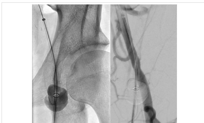
Figure 2: Angiogram with the CaveoVasc® protection system.

A. Guidewire in femoral artery. B. CaveoVasc® is applied after puncture of the femoral artery and placement of the guide wire, thus in the beginning of the procedure. C. Removal of Locator, blood backflow indicates correct position. D. Inflation of the Fixation Balloon – the inflated balloon secures the position of CaveoVasc® in the tissue. E. Placement of the sheath. F. Inflation of Pressure Balloon – Start of thrombolysis therapy via catheter perfusion. G. Removal of the sheath and catheter after the end of the thrombolysis procedure. H. Removal of CaveoVasc®.