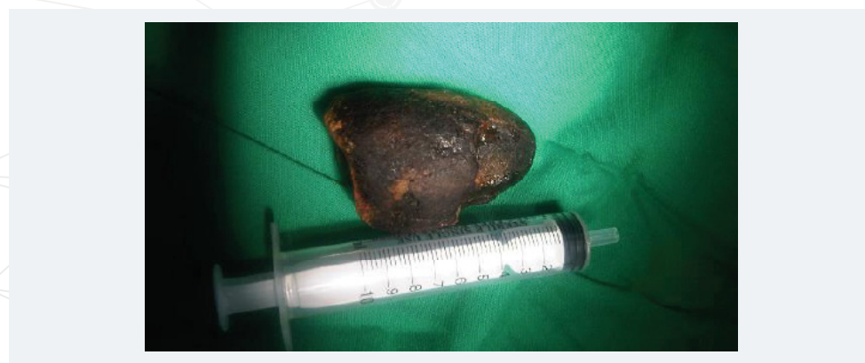
Figure 2: An extracted gallstone scaling with 10 cc syringe.