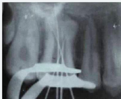
Figure 4: Working length determination using radiograph of #26.