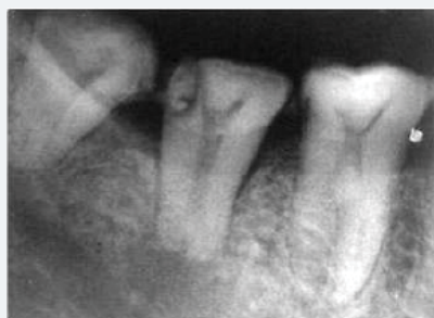
Figure 6: Pre- operative Radiograph of #37.