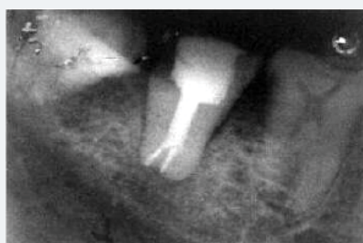
Figure 7: Post Obturation Radiograph of #37.

biometric method. According to this index system [16] hypotaurodontism is diagnosed when TI is 20-30, mesotaurodontism when TI is 30-40, and hypertaurodontism when TI is 40-75. In present case reports, 3 teeth including right maxillary first molar, left maxillary first molar and lower left second molar showed hypertaurodontism.