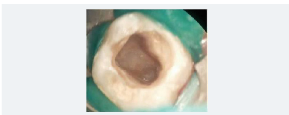
Figure 3: Access cavity preparation showing apical position of pulpal floor observed under DOM (8x) of #26.

consent from the parents). To evaluate presence of taurodontism in the lower molars, their IOPA was advised which did not show any characteristic of taurodontism. The diagnosis of pulp necrosis with bilateral hypertaurodontism in tooth #16 and #26 was made based on the clinical, radiographic and CBCT findings.