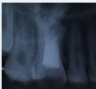
Figure 5a: Post Obturation Radiograph of #26.

percussion and palpation. Intraoral periapical radiograph of tooth #37 showed huge pulp chamber extending beyond the CEJ reaching the furcation in the apical third region (Figure 6). Two short roots were seen at the furcation area in the apical third indicating hypertaurodontism. The contralateral tooth showed no such aberration. The diagnosis of irreversible pulpitis with apical periodontitis and unilateral hypertaurodontism was made. Similar treatment procedure was carried out as in case 1 and final radiograph was taken that confirmed well obturated root canals in tooth #37 (Figure 7).