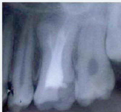
Figure 5b: Post Obturation Radiograph of #16.