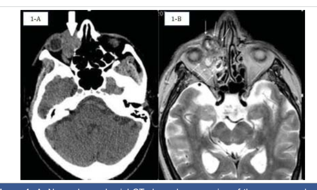
Figure 1: A: Non enhanced axial CT shows bone erosion of the papyracea lamina of ethmoid bone. B: Axial T2 weighted sequence shows an extraconal and intraconal mass (white arrows) in the right orbit, with non-homogeneous hyperintensity ed irregular margins. The lesion involves the nasolacrimal canal, the papyracea lamina and the anterior ethmoid cells.

MRI scan substantiated a T2 mildly hypointense, T1 isointense mass with erosion of the inferior orbital wall.